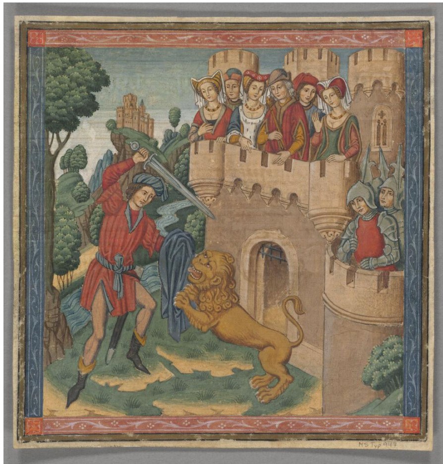
Harvard University, Houghton Library, ms_typ_947-METS

As Part 2 of 2, the 2025 Autumn Symposium continues our explorations of processes due to the work of “Agents and Agencies” in the realms of books of many kinds. Picking up the story from the Spring Symposium (with some overlap) at the points where the completed books in some form enter the world, we examine how they might encounter additional agents/agencies which effect responses, transformations, or re-creations. Such transformations may widely range (sometimes in conjunction with each other) from readers’ reactions to their texts and other contents, through structural interventions which might deconstruct the book into fragments thereof, to recreations in a variety of forms, which might involve reassembly in portfolios or albums of specimens, imitations or emulations, or outright forgery.