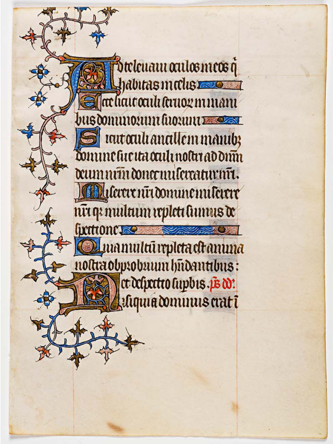
Figures 3–4. Vassar College, Archives & Special Collections Library, Nicholas B. Scheetz Collection: Leaves. Figure 3 (left). Scheetz MS 17, folio 58r. Peter Lombard, Great Gloss on the Pauline Epistles , France, 13th century. Figure 4 (right). Scheetz MS 42, recto. Book of Hours, Northern France, circa 1425.

Founded in 1989 in England as an international scholarly organization, and incorporated in 1999 in the United States as a nonprofit educational corporation for the purpose of “lectures, discussions, and other publications”, the Research Group on Manuscript Evidence exists to apply an integrated approach to the study of manuscripts and other forms of the written or inscribed word, in their transmission across time and space. The Research Group is powered mainly by volunteers and volunteer donations.