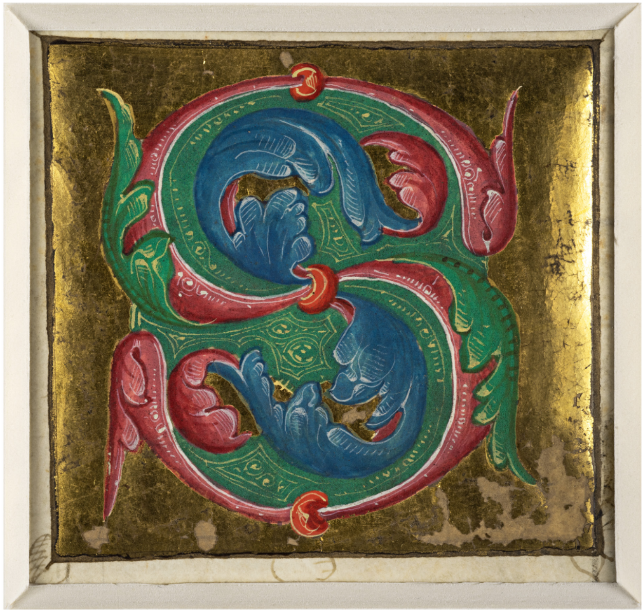
Figure 2. Vassar College, Archives & Special Collections Library, Nicholas B. Scheetz Collection, Scheetz MS 13. Cutting of a polychrome illuminated initial S from a choirbook. Composed of rotating foliate motifs upon a patterned ground, the letter is set against gold leaf background in a square-shaped frame and enclosed within a modern mat, with scraps of text on the back. Italy (probably Northeast), last quarter of 15th century. Scott Gwara (2014), pp. 81–82 (“Antiphonal illuminated by Jacopo Filippo de’Medici d’Argenta” at Ferrara); Peter Kidd (2024), pp. 182–183.