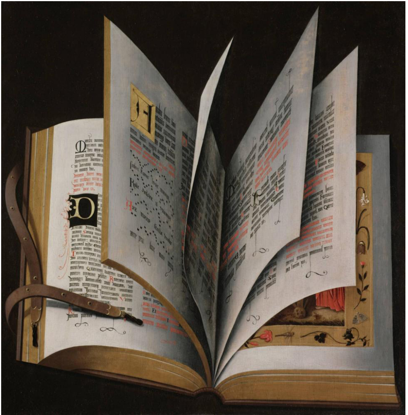
Figure 1. Poughkeepsie, Vassar College, The Frances Lehman Loeb Art Center, “The Open Missal” by Ludger tom Ring the Younger (1522–1584). Oil on wood panel (transferred to masonite). Circa 1570.

The oblique view of an opened book, seen at an angle from the bottom of the textblock, displays pages partly fanned outward in four segments (a group of leaves at the left and three individual leaves to the right) between the front and back sections which part about one-third of the way from the front, with a slight spreading between some segments at lower and outer edges. At the left, a pair of unfastened brown leather straps emerges from the front cover of the matching brown binding, drapes across the foreedge or the lower part of the exposed page, and leads to rounded golden mounts with extended black tongue-like terminals. The pages have gilded edges; the cover extends somewhat beyond them; and the outer portion of the grouped left-hand pages curves downward over its lower edge.