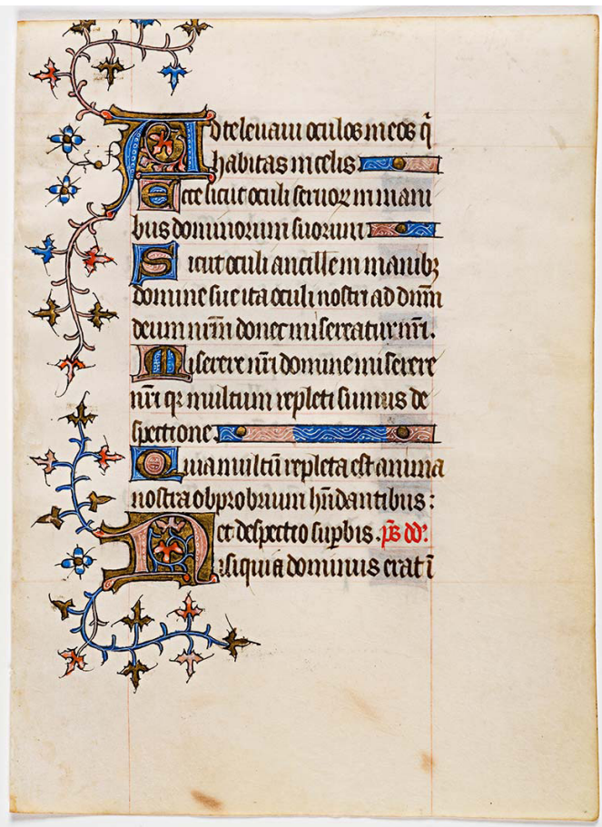
Figures 3–4. Vassar College, Archives & Special Collections Library, Nicholas B. Scheetz Collection: Leaves.