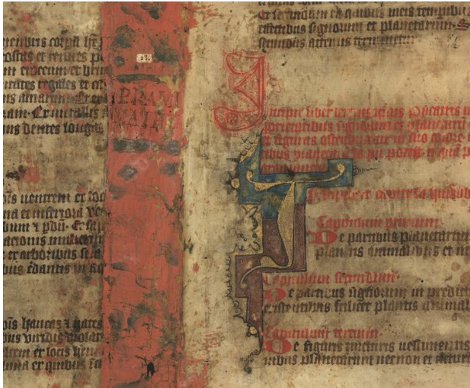
Martin, Slovakia, Slovak National Library, Fragment of the Picatrix, circa 1400 CE.