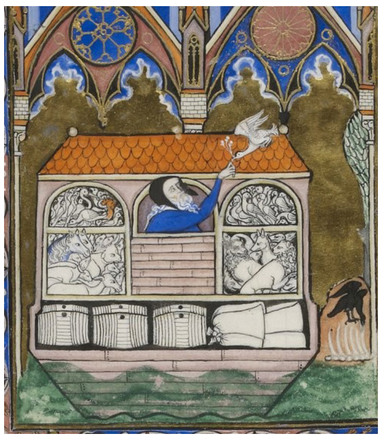
Monday, 1 June 2024 Session 129 11:15 am – 12:45 pm (Hybrid)