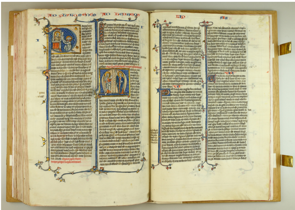
Image: Oslo, Christiana Kathedralskoles Bibliothek, Schøyen MS 223, fols. 114v–115r.

We look forward to welcoming you at our events!